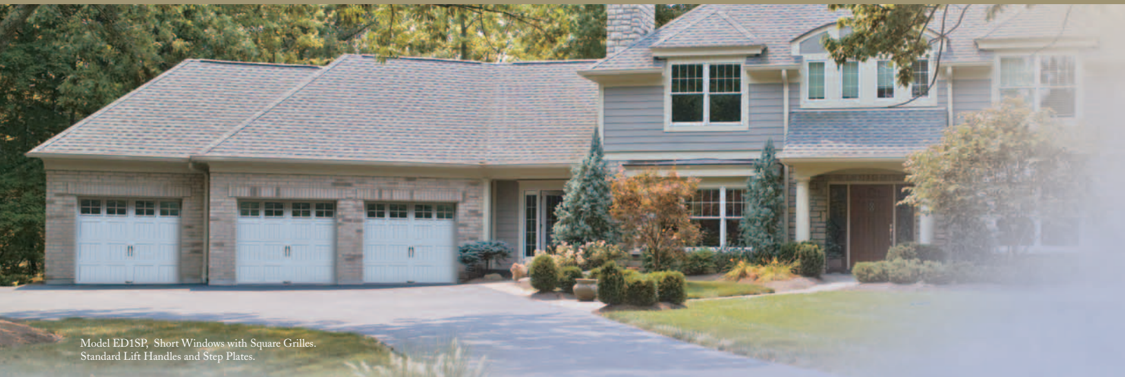
Model ED1SP, Short Windows with Square Grilles. Standard Lift Handles and Step Plates.