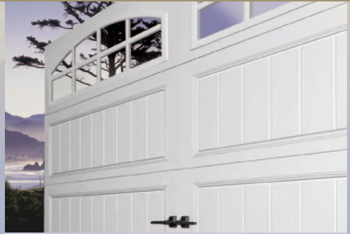
Large Authentic Arch Window Designs and Beautiful Panel Detail

The Expressions® Series three-layer construction provides exceptional strength, insulation and dent resistance as well as a beautiful carriage house appearance. The 1-3/8" of expanded polystyrene insulation and thermal break make these doors heat and cold resistant while the tongue-and-groove joint helps seal out wind, rain and snow. Available in short and long panels with multiple window options, the three-layer Expressions® Series is virtually maintenance-free, so the first fabulous impression becomes a lasting impression.