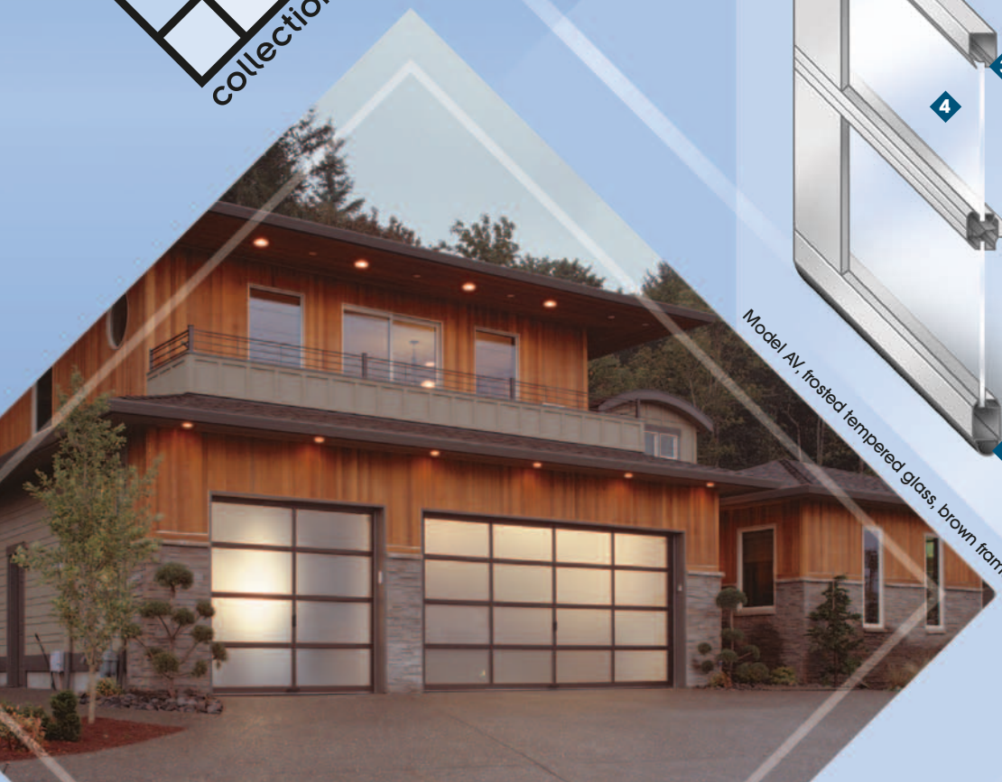
Model AV, frosted tempered glass, brown frame