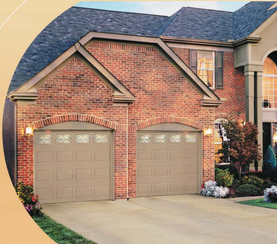
Model 135 Standard Classic Raised Panel shown in Sandtone with optional Charcoal Flame Designer Classics Windows