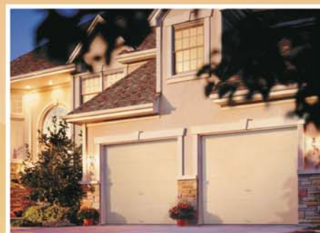
Model 136 Flush Design Panel shown in Almond

Due to printing process, colors may vary. Please request an accurate color chip.